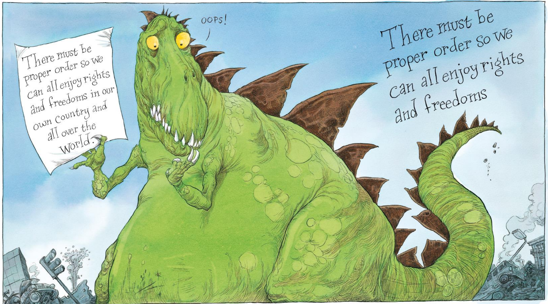
Artist: Chris Riddell